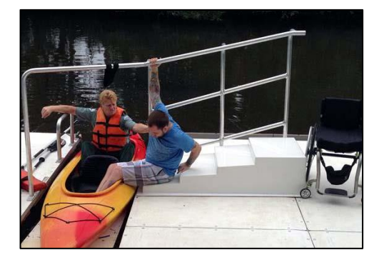
Fish Camp County Park Accessible Fishing/Boating Concept Plan: