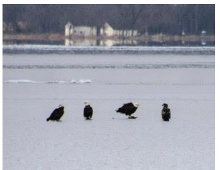
Eagle Photos from Cindy Guiney