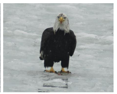
Eagle Photos from Deb Weis