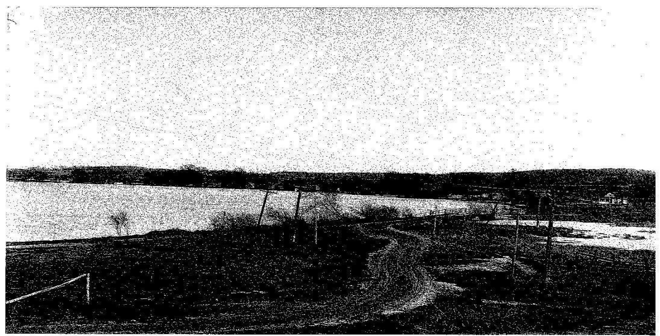
1903- Bridge at Old Barber Trailer Court